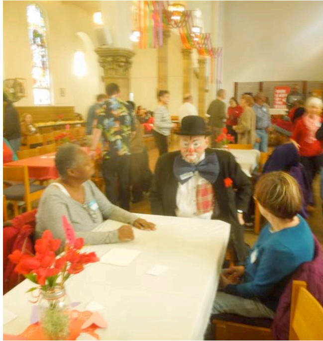
Clowns visited the party to entertain the guests.