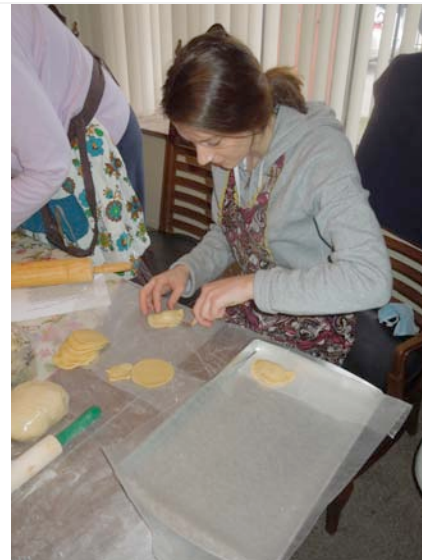
High-precision Pierogi making!