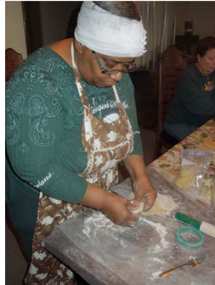
New friends joined the fun!