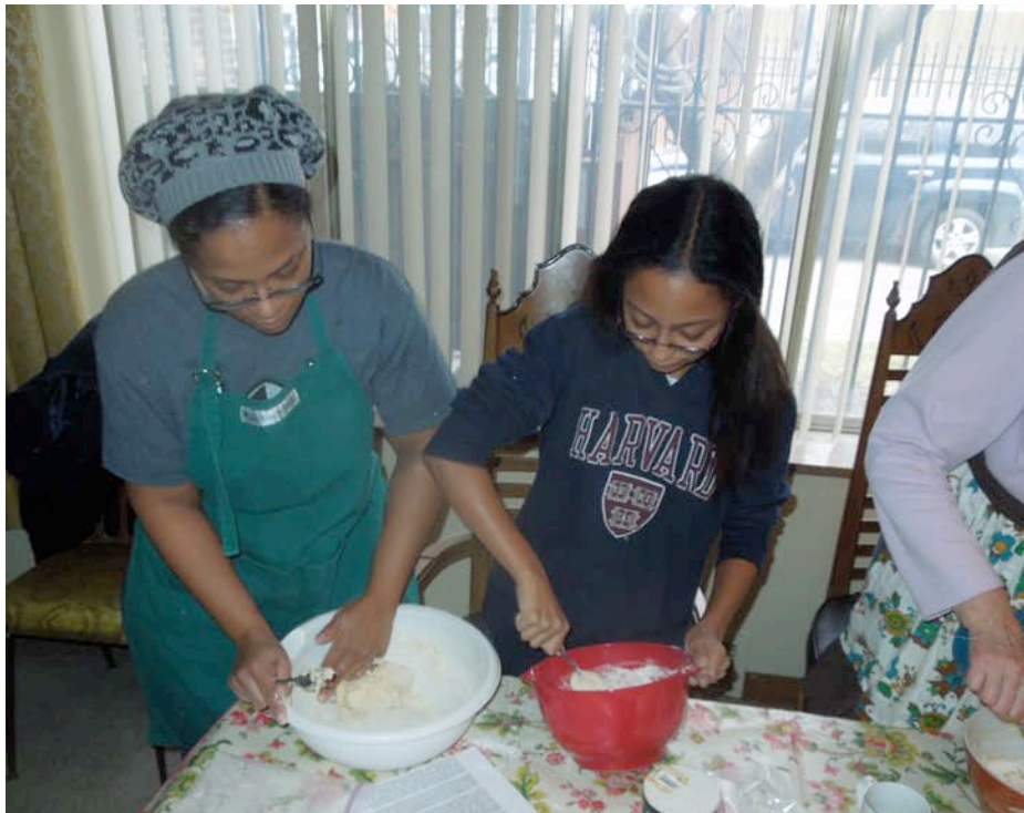
Mother and Daughter—a team!