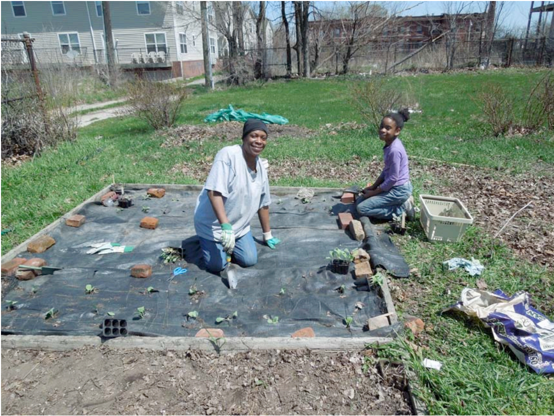
A true community garden—parents and children working and learning together.