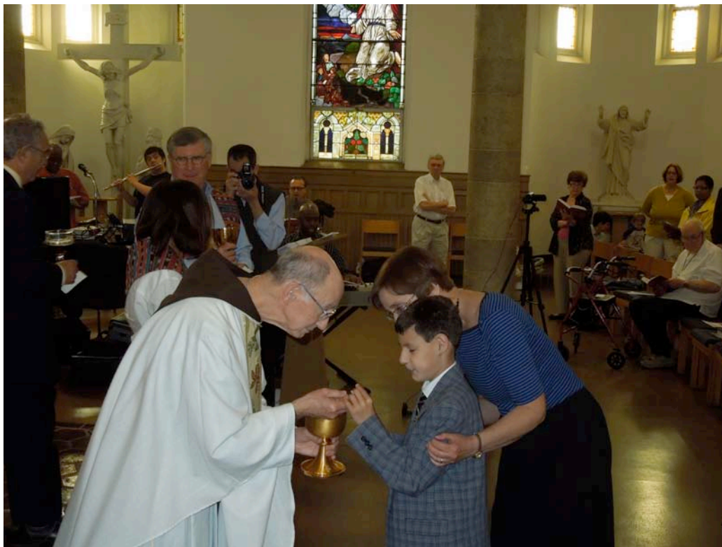
After months of instruction, the moment has arrived!